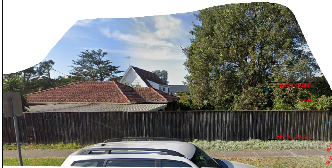
No.1 Attunga Avenue